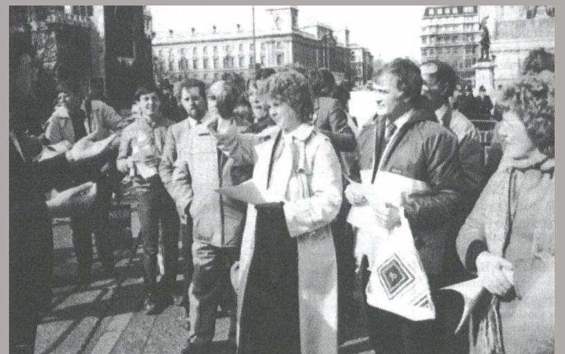
Deaf manifestants with a BSL interpreter, 1986